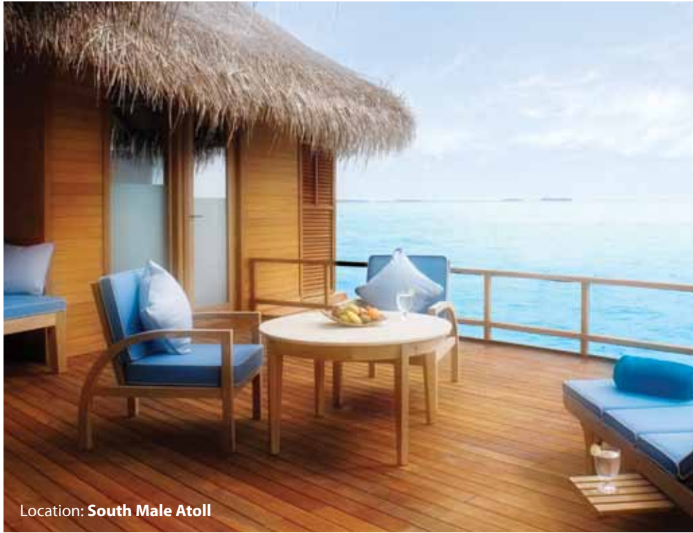
Location: South Male Atoll