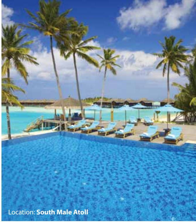
Location: South Male Atoll