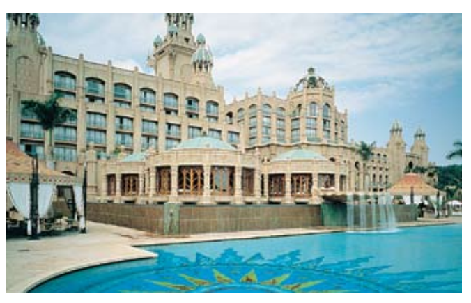
The Palace of the Lost City