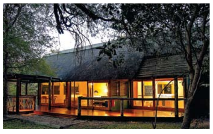
Savute Safari Lodge