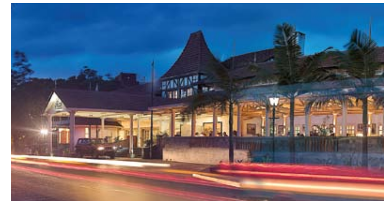
The Fairmont Norfolk Hotel