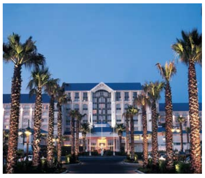
Table Bay Hotel