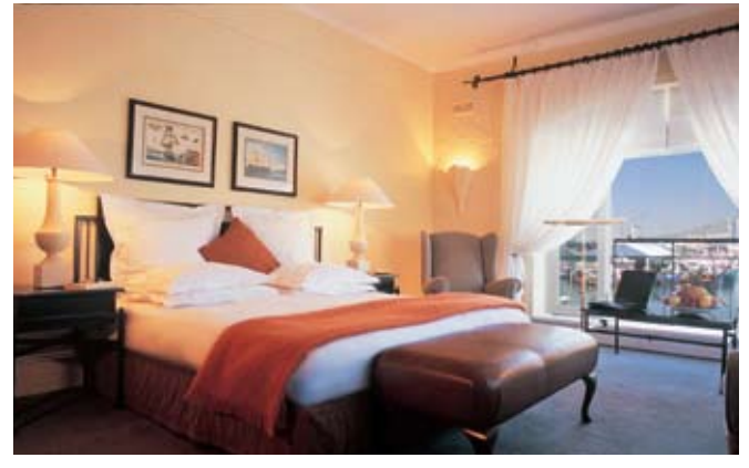
V & A Hotel

Here are Wildlife Safari's five favourite, and most popular properties in South Africa. The Melrose Arch Hotel in Johannesburg's northern suburbs is a luxury "hip" hotel offering an outstanding guest experience with some unique twists. The Palace of the Lost City at Sun City is an iconic resort hotel, famous globally, and any visit to South Africa is incomplete without a stay at this incredible hotel. We currently have three favourite Cape Town hotels, all situated at the V & A Waterfront. The V & A Hotel, the original hotel, still retains its charm and inobtrusive service. The Table Bay Hotel is a large world class hotel with all the facilities with views to both Table Mountain and Atlantic Ocean. The Cape Grace Hotel is a small, exclusive hotel that is more like a private club than hotel. Wildlife Safari has a much larger selection of hotels, lodges and resorts throughout South Africa, call us for details.