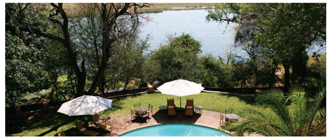
Chobe Game Lodge