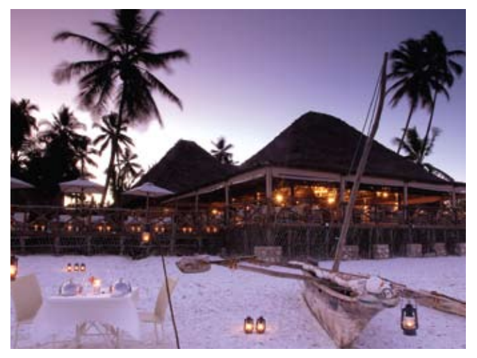
The Fairmont Zanzibar

The Fairmont Zanzibar is a luxury beachfront resort on the eastern side of Zanzibar island and the perfect place to spend three, or more, days relaxing after "The Fairmont Safari" and enjoying the water sports and spa facilities.