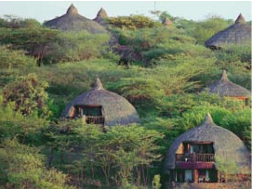
Serengeti Serena Lodge