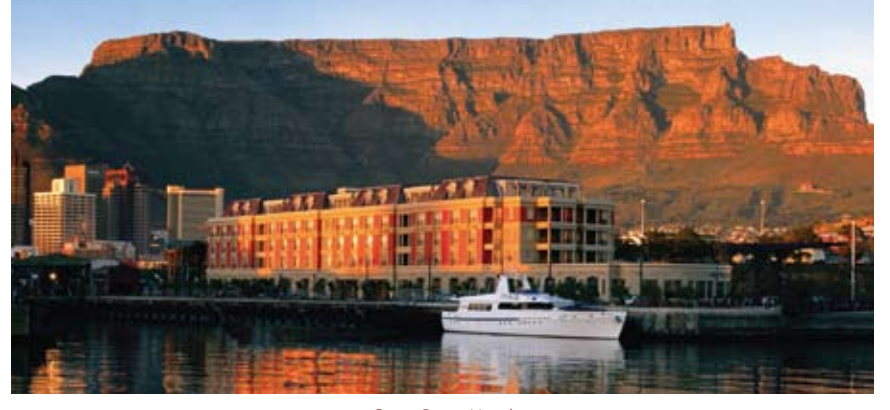
Cape Grace Hotel