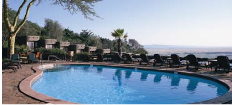
Mara Serena Lodge