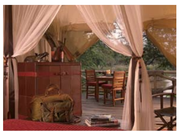
Mara Safari Club