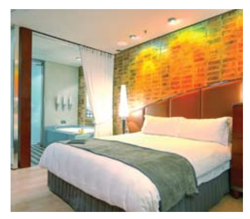
Melrose Arch Hotel